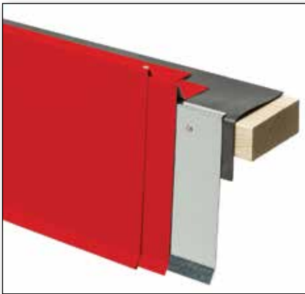
UNA-Edge™ GS GravelStop System

Firestone Building Products offers a simple and straightforward answer to architectural sheet metal detailing. There are no spring clips or extruded components in the UNA-Edge Metal Edge System. This results in easy-to-make field miters for drip edge and gravelstop roofing details. Firestone delivers the assurance & security you require for all your building projects.