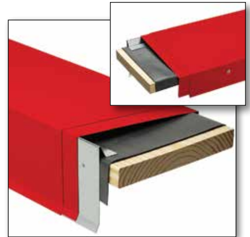
UNA-Edge™ CO Coping System